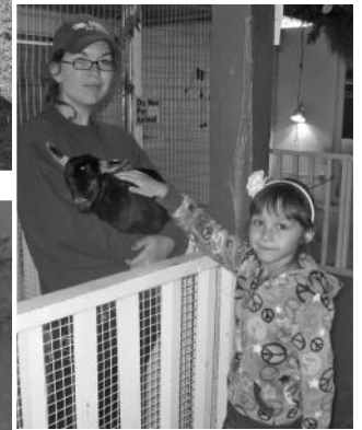
Animals of all kinds to pet, watch & enjoy!