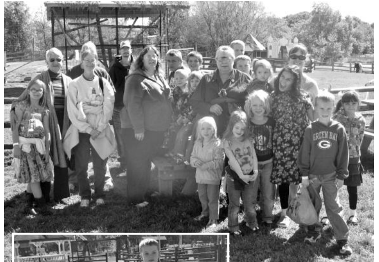
24 Students, Parents, Grandparents & Teachers enjoyed the animals & show on Oct. 2nd.