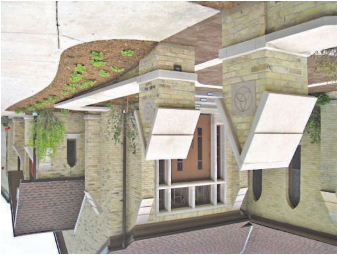
The New Side Entrance & Courtyard

INSIDE: See information about our upcoming Community Open House on June 26th!